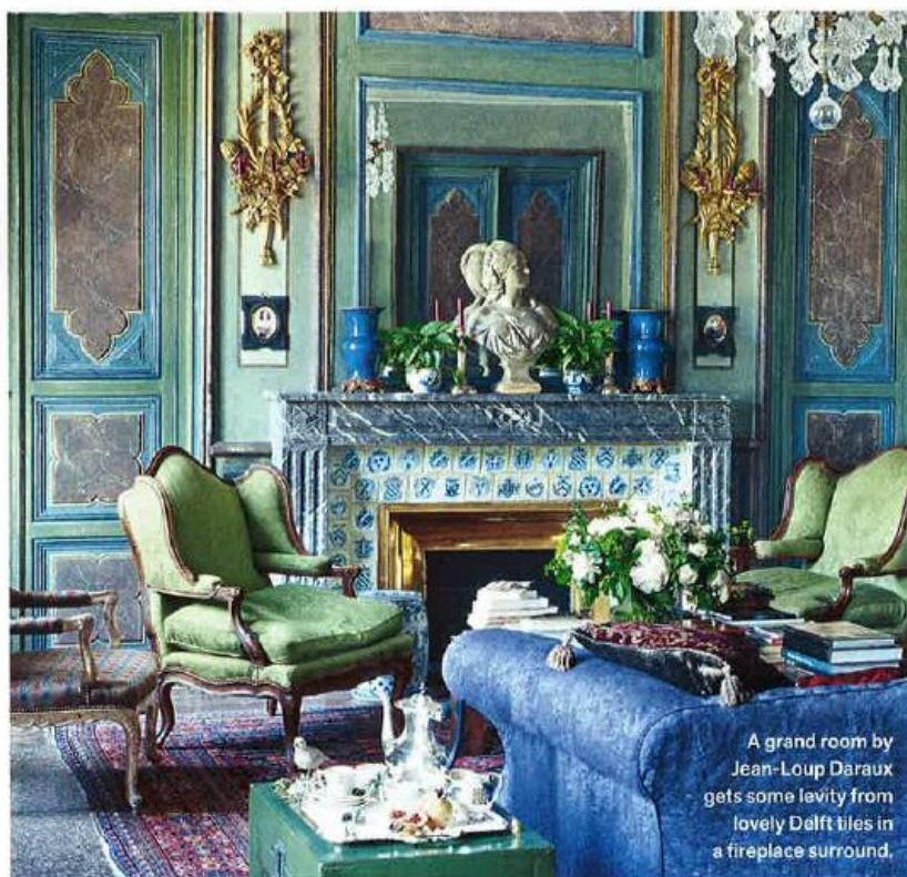
A grand room by Jean-Loup Daraux gets some levity from lovely Delft tiles in a fireplace surround.